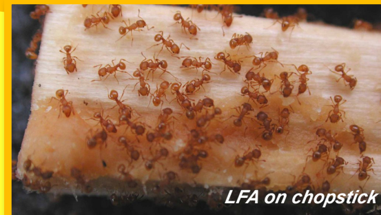
LFA on chopstick