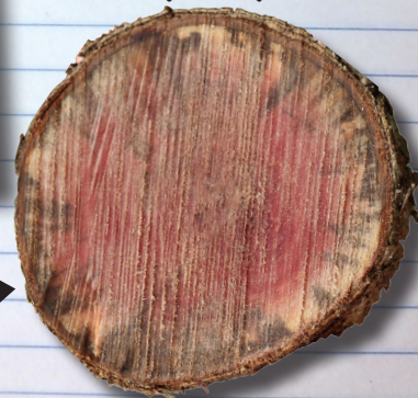
Radial staining of sapwood.