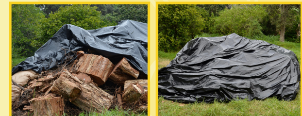
Infected ‘ōhi’a logs (left); ‘ōhi’a logs properly secured under tarp (right).

Work with a certified arborist to cut an infected tree cut down, if possible. Standing dead ‘ōhi’a attract boring beetles that may play a role in spreading ROD. Once on the ground, the tree may be cut up and burned safely in a fireplace, imu, or barbecue pit, or at least stacked, and covered with a tarp or weed mat to reduce beetle activity. Remember to decontaminate all equipment and clothing after disposing of trees and material.